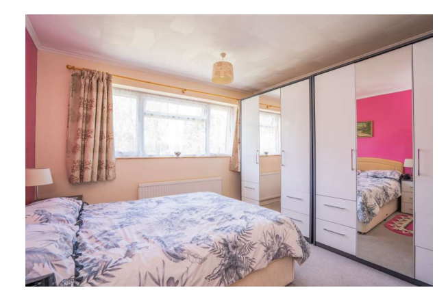
BEDROOM ONE a rear aspect room, double glazed windows, built in wardrobes, radiator

LANDING with access to loft space, window to side