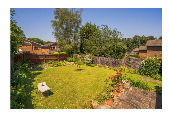
THE REAR GARDEN with paved seating area and steps leading down to a good sized lawn area with well stocked borders and is enclosed by panel fencing.

TO THE FRONT there is a car port and area laid to lawn.